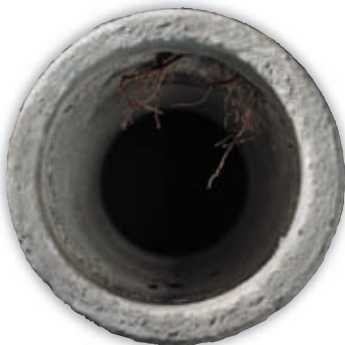
RootX removes virtually all the roots, restoring pipeflow capacity.