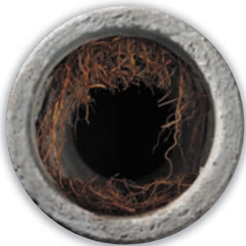
Mechanical cutting of roots clears roots from pipe... and leaves some behind.