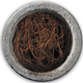
Roots can clog pipes causing blockages and sewer overflows.