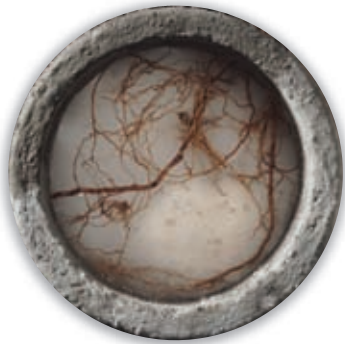
RootX attacks and kills the roots and inhibits regrowth.